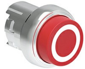
Pushbutton actuators, spring return, with symbol LPSB21